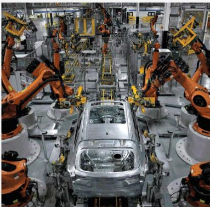
MANUFACTURING DISCRETE & PROCESS