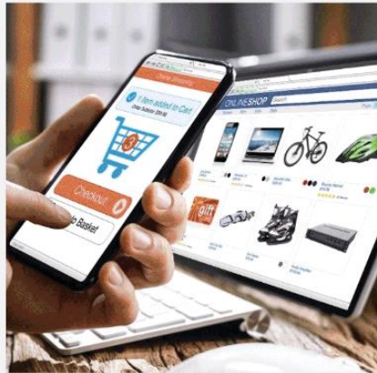
DIGITAL NATIVES & E-COMMERCE