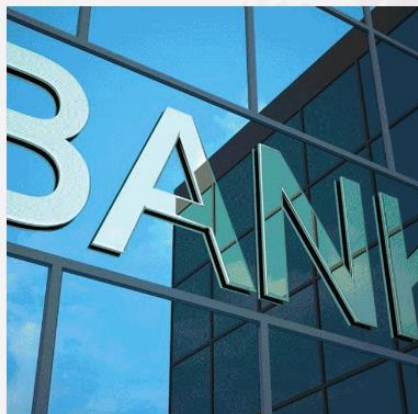
BANKING & FINANCIAL SERVICES